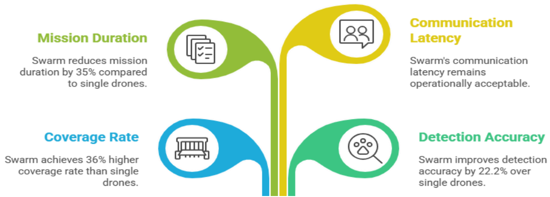
Figure-2. Revolutionizing Agriculture with Drone Swarms