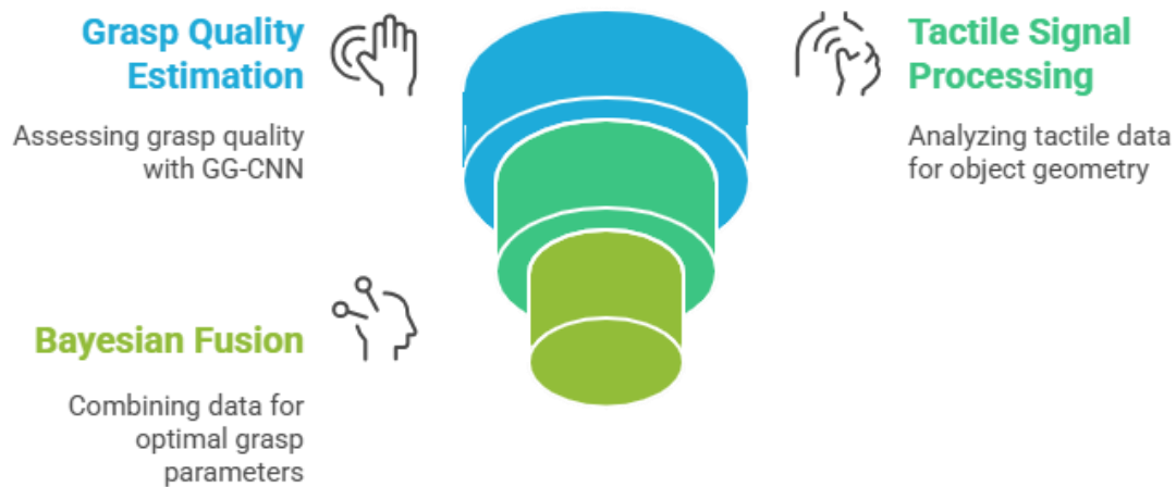
Figure-1. Predictive Grasping Process

Predictive object recognition addresses this limitation by enabling the robotic system to infer the object's class and grasp affordances before physical interaction. Vision-based approaches leveraging convolutional neural networks (CNNs) like YOLO for detection and GG-CNN for grasp quality mapping have demonstrated high accuracy in controlled settings (Li, Wang, & Zhao, 2023). However, environmental factors such as variable lighting, occlusions, and reflective surfaces can degrade visual performance, leading to failed grasps. Tactile sensing, on the other hand, provides direct measurements of contact forces and deformation, allowing for precise adjustment of grasp parameters even when visual data are unreliable (Wang & Wang, 2019). Prior work embedding pressure and bend sensors in soft grippers achieved over 90% classification accuracy for a limited set of objects but did not integrate precontact predictions with vision to optimize grasp planning (Goh et al., 2022).