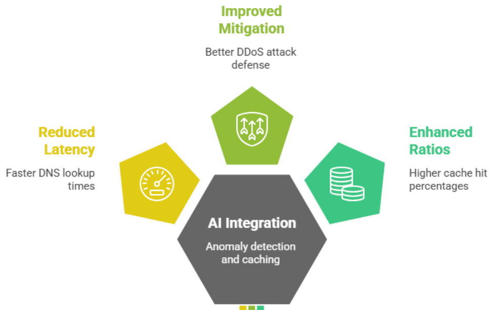
Figure-2. AI-Backend Decentralized DNS Improve CDN