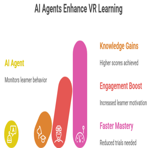
Figure-2. AI Agents Enhance VR Learning